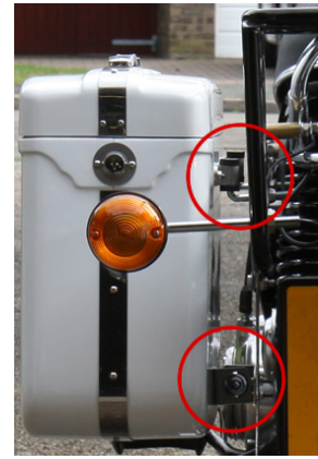
Fig 2a (R, top) Fig 2b (R, bottom)