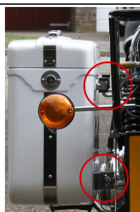
Fig 2a (R, top) Fig 2b (R,