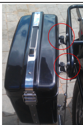
Fig2 (left bottom)