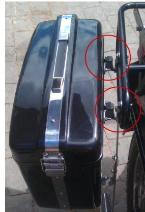
Fig2 (left) (R, bottom)